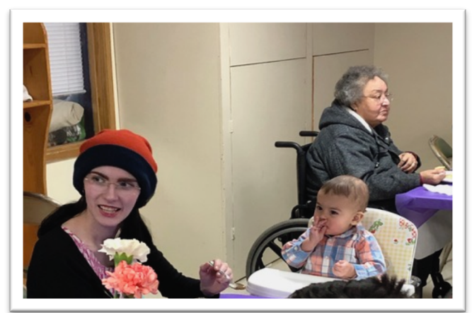
Enjoying Shrove Tuesday Pancake dinner together with parishioners from Christ Church Cathedral