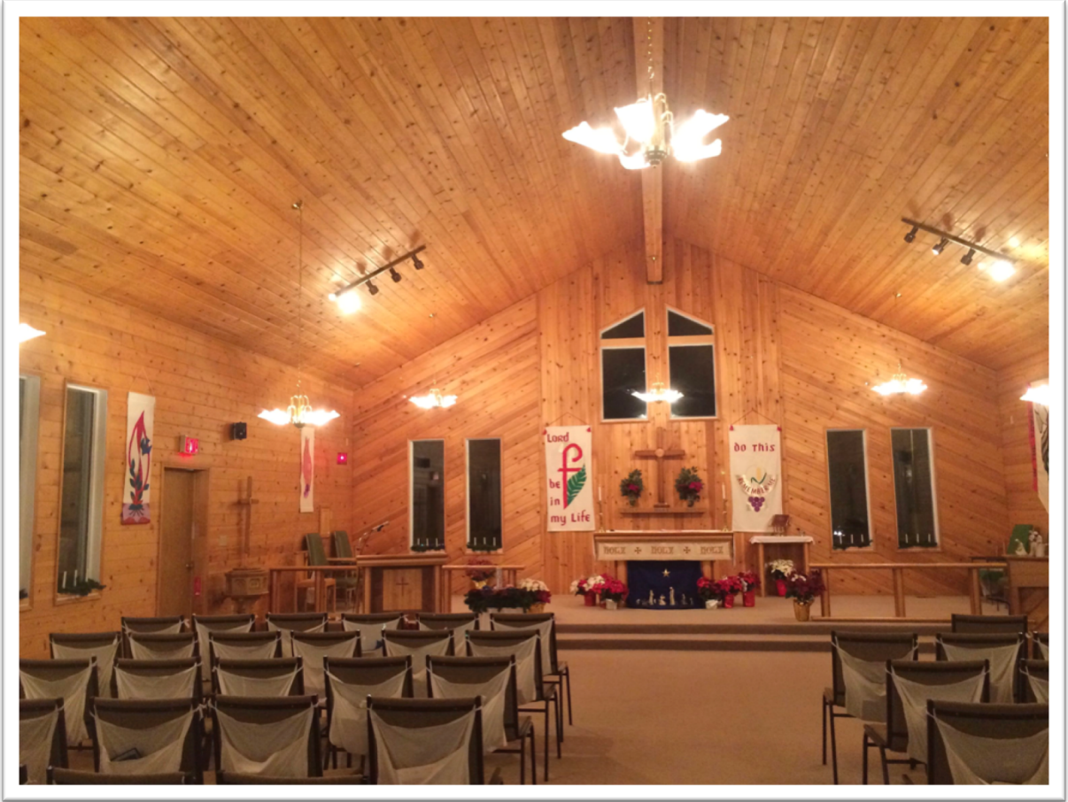
Church of the Northern Apostles